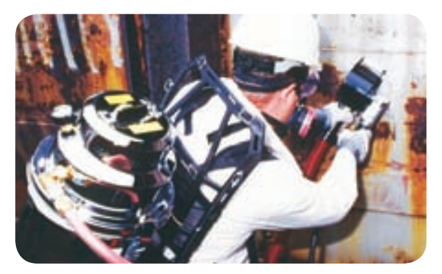
Air Backpack model with RotoPeen tool removing rust from a steel structure.